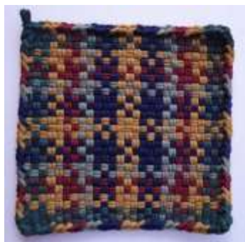
Potholder 1 & 6

Click on the images below to view the instructions for each potholder